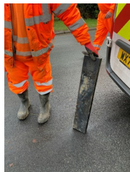
6x2x30 inch wooden plank that was removed from the 9 inch sewer pipe

Finally, should there be a keen meteorologist within the village, who maintains a daily rainfall record, would you be happy to share your data with the Parish Council?