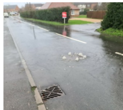
Drain overflowing at Lower Road / Front Road Junction (23/12/22)