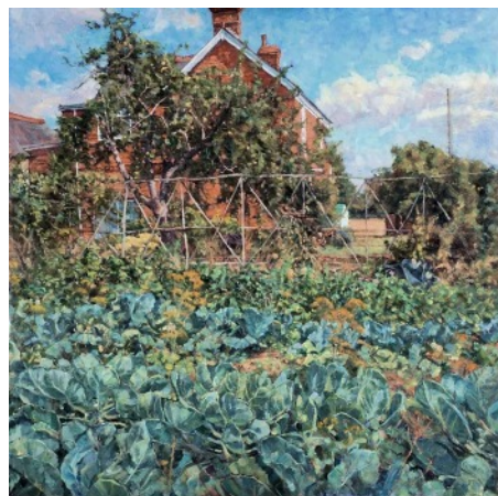
The Kitchen Garden