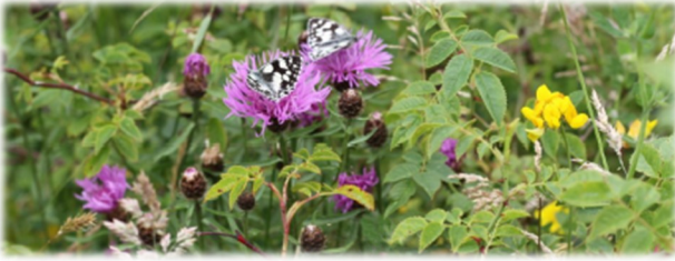
Marble White Butterflies

Parking can be found in the village and in the car park at the Memorial Hall. Please do not block drive ways and access points.